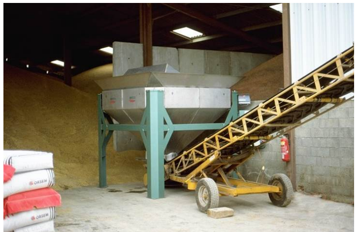
an MV 5000 in use