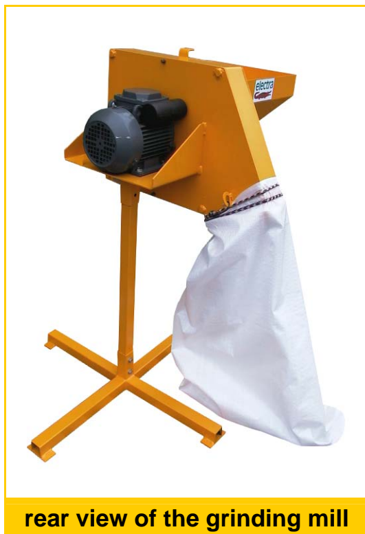
rear view of the grinding mill