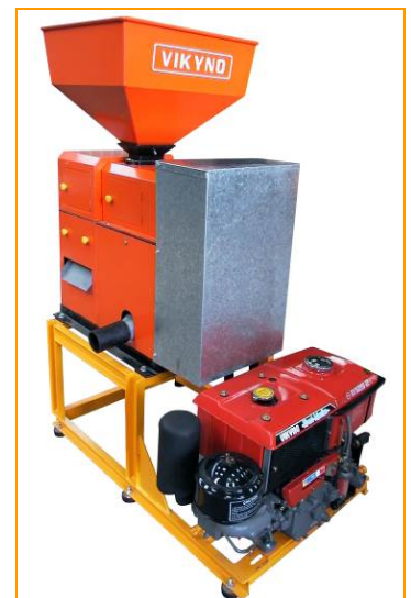
POLISHER WHITENER CCB 700 ENGINE- POWERED VERSION

Equipment intended for export outside the EC