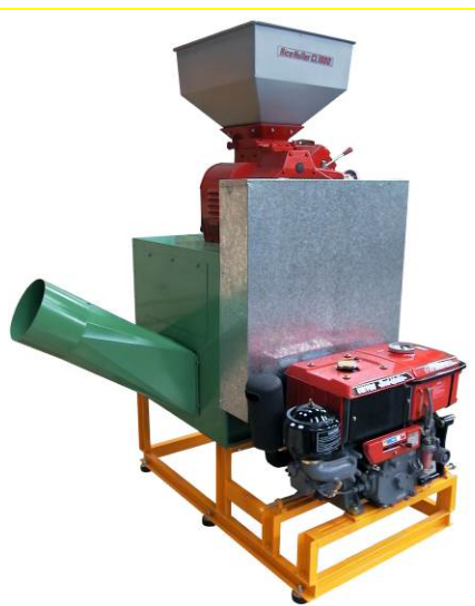
ROLLER HULLER CL 1000 ENGINE-POWERED VERSION